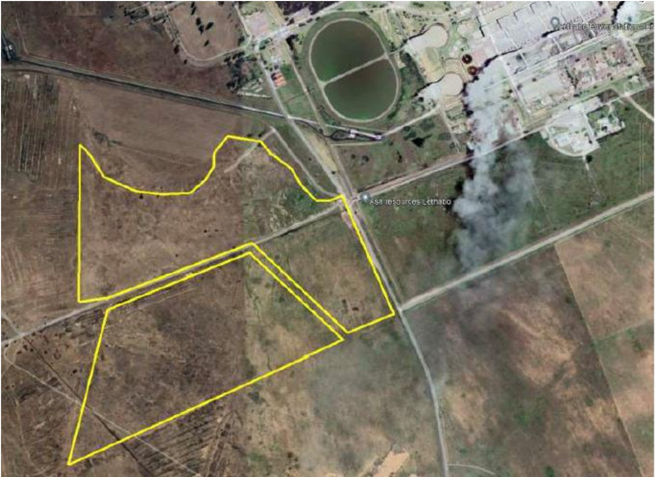
Figure 1: Proposed outline of NLEPDS security fence.

When downloaded from the document management system, this document is uncontrolled and the responsibility rests with the user to ensure it is in line with the authorized version on the system.